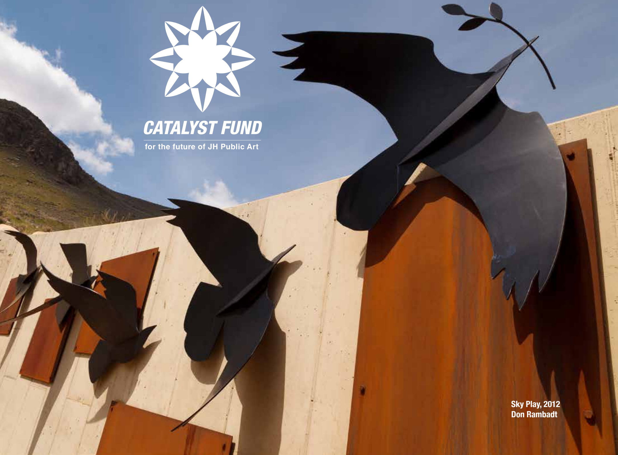
Sky Play, 2012 Don Rambadt