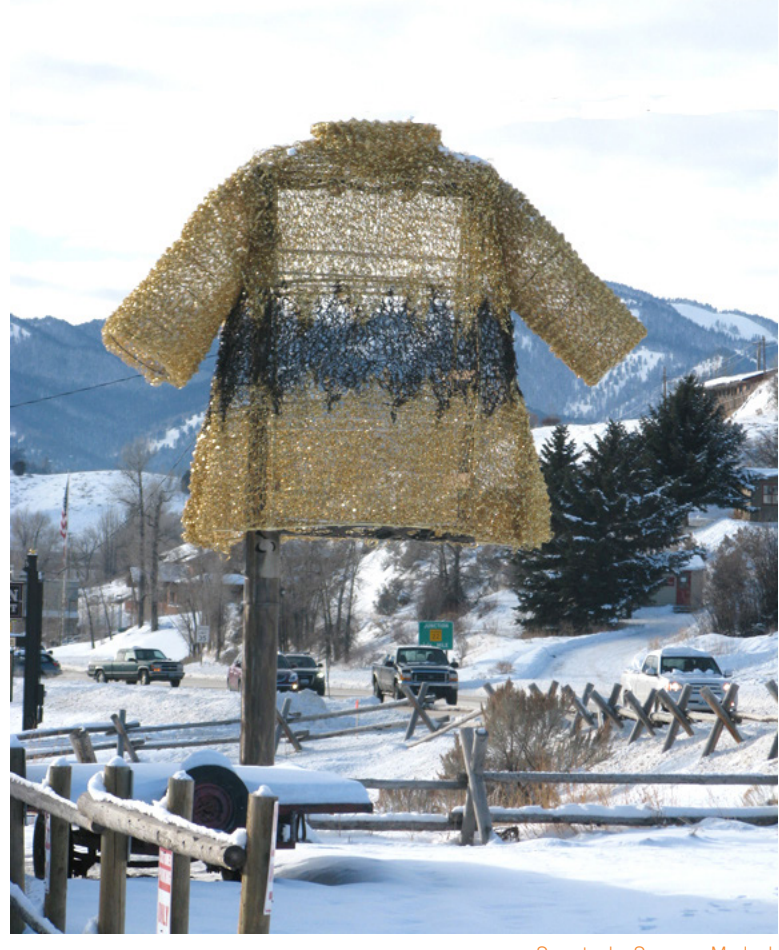
Sweater by Suzanne Morlock

Applications due: September 14, 2018 Submit to: cal@jhpublicart.org